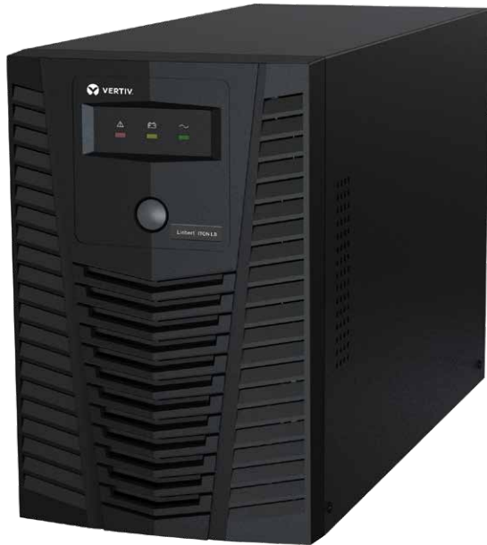
Liebert® ITON™ 1000VA LB